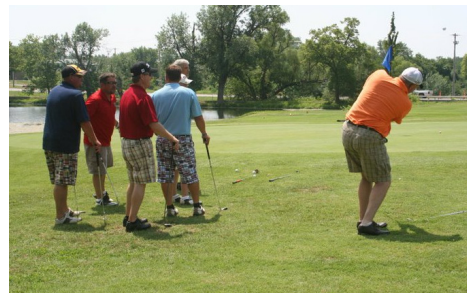
120 golfers joined us for the Annual Golf Classic, raising over $15,000!